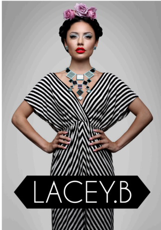
Lacey B. Designs- Pensacola, Florida