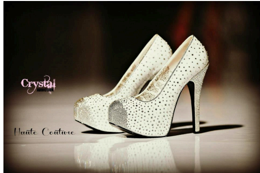
Crystal Addiction- Ponte Vedra, Florida