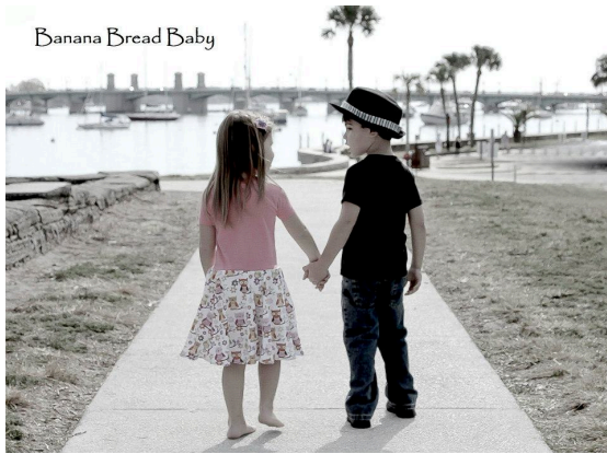
Banana Bread Baby- St. Augustine, Florida